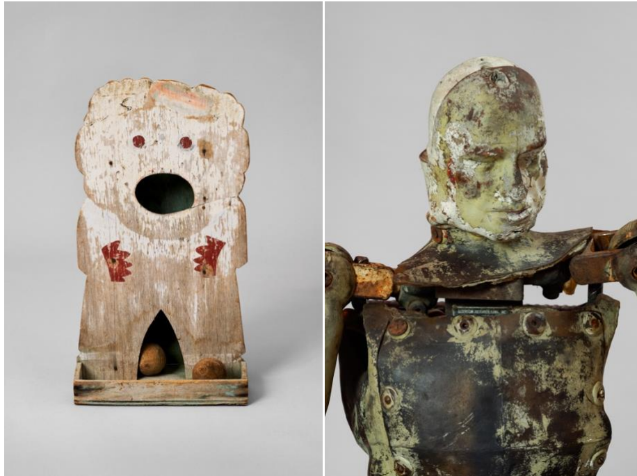
Left: Passe-boule Ball Toss Game, France, c. 1900. Painted wood; Right: Crash Test Dummy, Alderson Research Labs, Inc USA, c. 1960. metal, rubber.