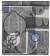
Shirley Moorhouse Spaces , 2023 Flyscreen, beads, metallic tulle, metallic threads, found objects 34 x 30 inches Collection of the artist