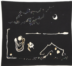
Shirley Moorhouse We Stand on Guard , 2011 Mixed media on wool, 73.5 x 79.6 cm / 29 x 31.25 inches Indigenous Art Collection, Crown-Indigenous Relations and Northern Affairs Canada