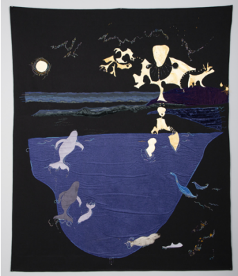
Shirley Moorhouse, Pure Energy , 2000 Mixed media on wool, 175.3 x 147.3 cm / 69 x 58 inches Indigenous Art Collection, Crown-Indigenous Relations and Northern Affairs Canada