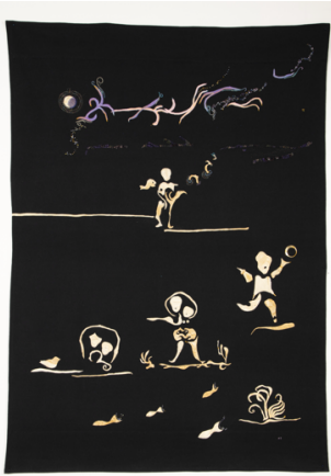
Shirley Moorhouse The Brass Ring , 1998 Black stroud, smoke-tanned caribou hide, various materials 61 x 44 inches (152 x 114 cm) Collection of the artist