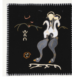
Shirley Moorhouse The Spirit Soars , 1996 88 x 78 cm / 34.5 x 30.75 inches Black stroud, smoke-tanned caribou hide, various materials Government of Newfoundland and Labrador Collection, The Rooms