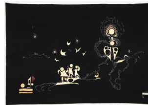
Shirley Moorhouse Dancing to the Moon , 2020 Black stroud, smoke-tanned caribou hide, various materials 43 x 61 inches Collection of the artist