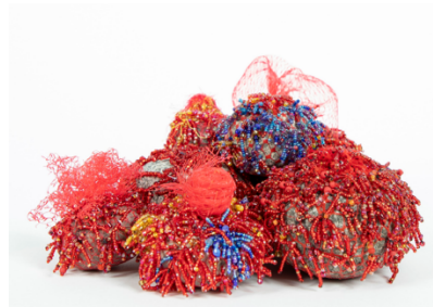
Shirley Moorhouse Beaded Glacial Rocks , 2020 7 rocks with mixed media Collection of the artist